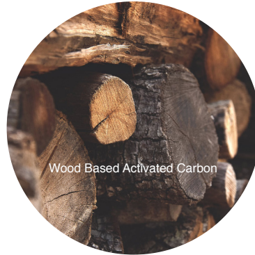
Wood Based Activated Carbon