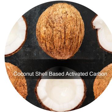
Coconut Shell Based Activated Carbon