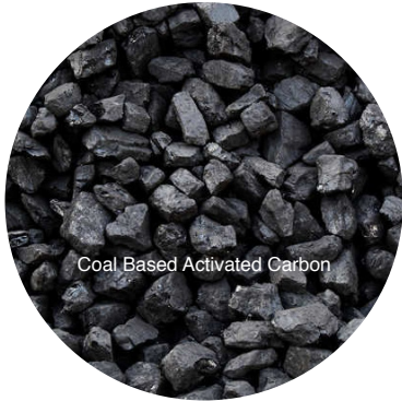
Coal Based Activated Carbon

One of the earliest elements that human being came into contact with, it was first edited for naturalization in 1787.