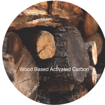
Wood Based Activated Carbon