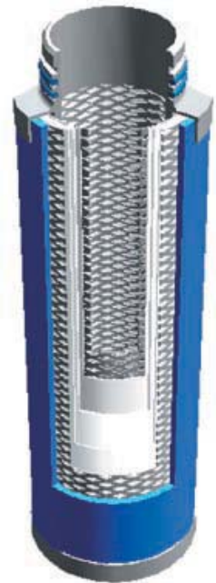
Cross section of the depth filter

By utilising various filtration mechanisms such as retention by direct impact, sieve effect and diffusion effect, liquid aerosols and solid particles down to the size of 0.01 µm are being retained in the filter.